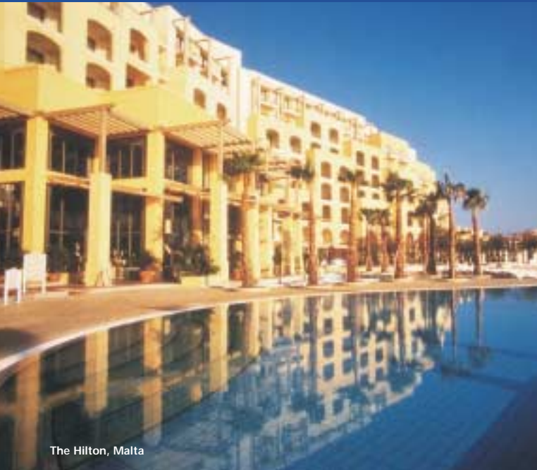
The Hilton, Malta

40 – 60% reduction and 1 000 Bonus Miles