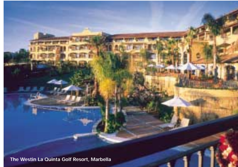
The Westin La Quinta Golf Resort, Marbella