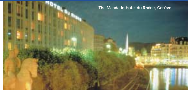
The Mandarin Hotel du Rhône, Genève

There are also two new resorts: Elbow Beach in Bermuda and the newly-opened Mandarin Oriental Ananda in the Himalayas, India.