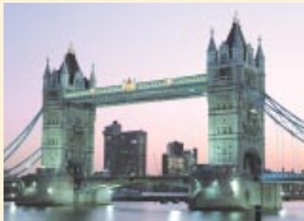
London Tower Bridge

Not only is the Forbes line-up of experts something to keep you taking notes, but headline comedians, singers, and gifted soloists and ensembles from New York's renowned Juilliard School enliven the atmosphere.