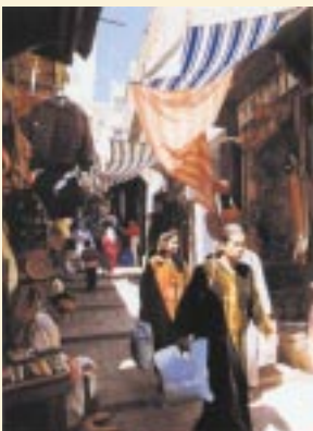
Souks (market) in Morocco

Morocco's "Great White City" is one of the largest harbors in Africa. Centuries old, Casablanca nestles on the Atlantic coast; this is Morocco's largest city and principal port. Awaiting your discovery is a timeless blend of Arabic culture and French sophistication. You can explore the city's intriguing blend of the old and the new. Shopping in the overflowing stalls of the exotic souks is incomparable. Who doesn't want to go to Rick's American Bar and remember the spirits of Bergman and Bogart?