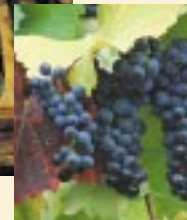
The magnificent countryside of Bordeaux

The world's best wines and haute cuisine come from Bordeaux, a gourmet's paradise. Your Forbes private tour experience of Bordeaux will begin with a scenic drive through the elegant architecture of Bordeaux, a city that is richly steeped in culture and heritage. Your unique tour of the great vineyards becomes an education in winemaking as you lunch at one of the celebrated grand chateaux of Bordeaux, where growers share their celebrated regional history.