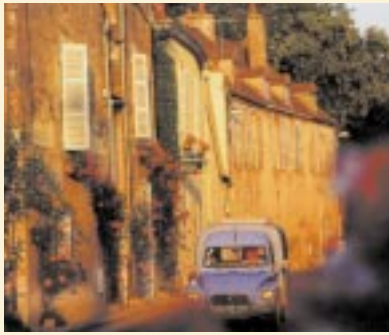
Winding roads of Bordeaux