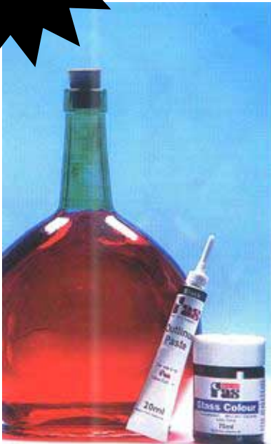
Ask for our Glass Colour Brochure